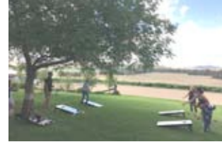
CORN HOLE 3 Available