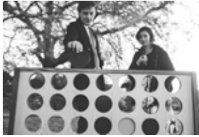
CONNECT 4 1 Available