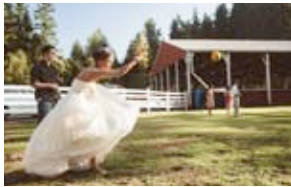
BOCCE BALL 3 Available