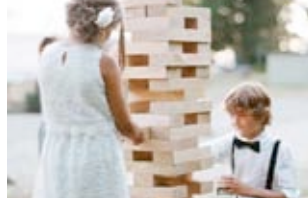
JENGA 1 Available