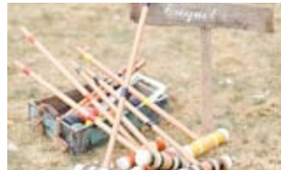
CROQUET SET 1 Available

Games included when you book your wedding with us